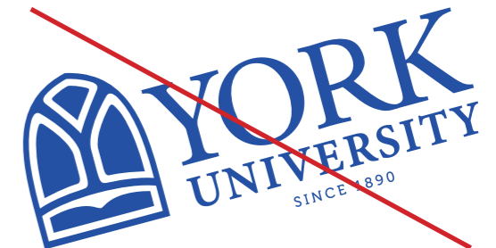
Do not tilt the logo