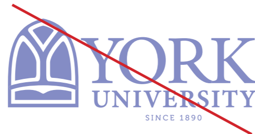
Do not change the opacity of the logo.