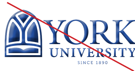
Do not add a special effects to the logo.