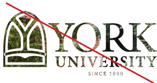
Do not allow a pattern or photograph to show through.