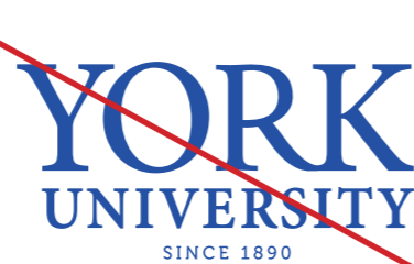
Do not show the word mark without the window mark.